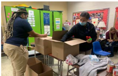
Students packing donations

On February 24th Russia started an invasion of Ukraine. Cities like Sumy, Enerhodar, and Kyiv had to be evacuated. Millions of mostly women and children fled to nearby countries for shelter. Now people around the world want to show their support and help these people in need. Here at Halsey, we are doing our